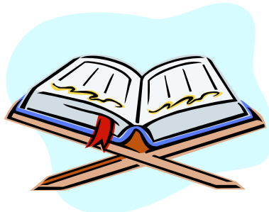
The Holy Qur'an